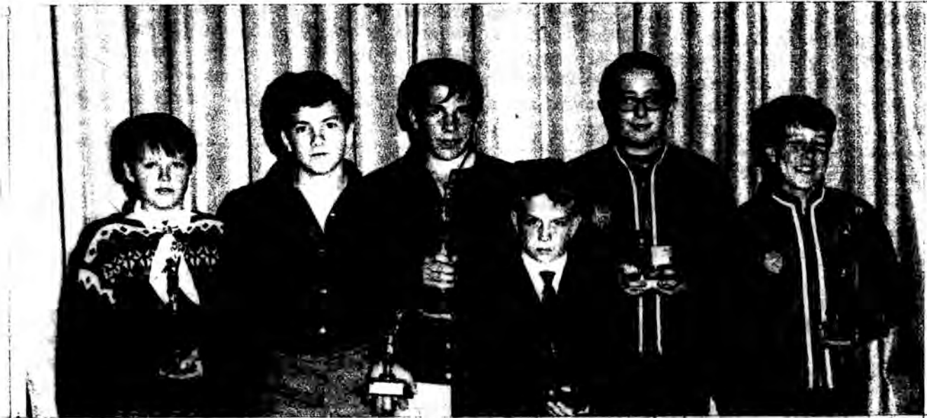
Pictured above, the outstanding Cadets of 1969 with trophies as presented at the 1969 Awards Night, October 28th.