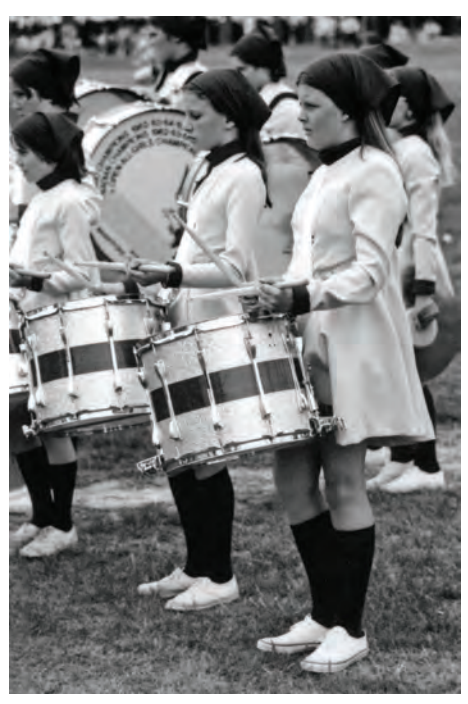
Belles of St. John's (1977)

result their membership increased to 110 in 1973. They were also known as the "youngest" Corps, because the average age of their members was only 14 years old. This prompted the Board of Directors to create a Junior Drum and Bugle Corps, to be known as the