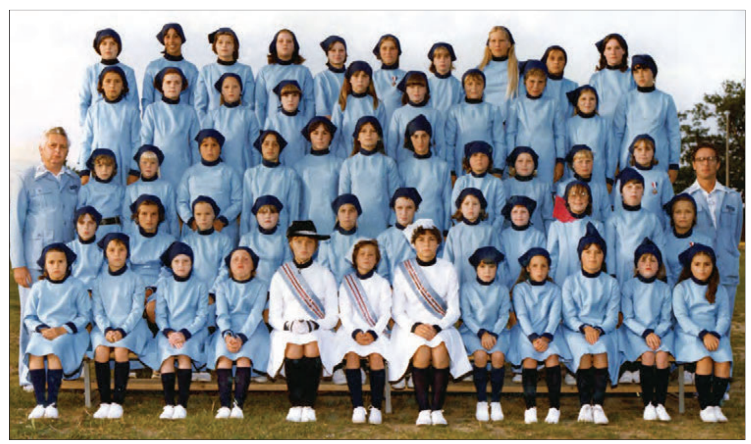
Belles of St John's (1977)