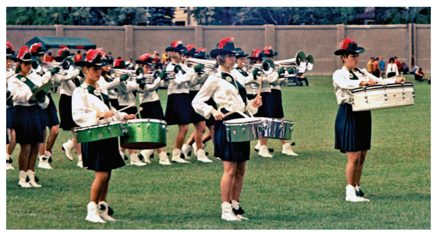
St John's (Nationals, Kingston, 1968)