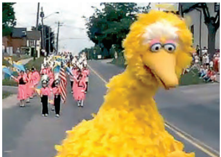
St John's in "Follow That Bird" (1984)

and the famed cast and crew of Sesame Street. The movie was released in August 1985 and the Corps performed an exhibition show outside the Capitol Theatre when the movie premiered in Brantford.