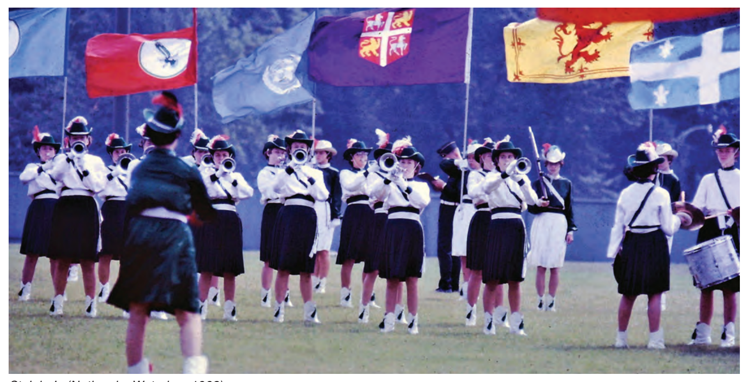
St John's (Nationals, Waterloo, 1962)