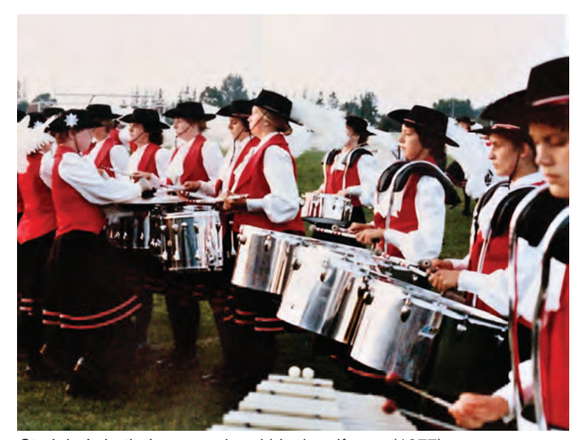
St. John's in their new red and black uniforms (1977)