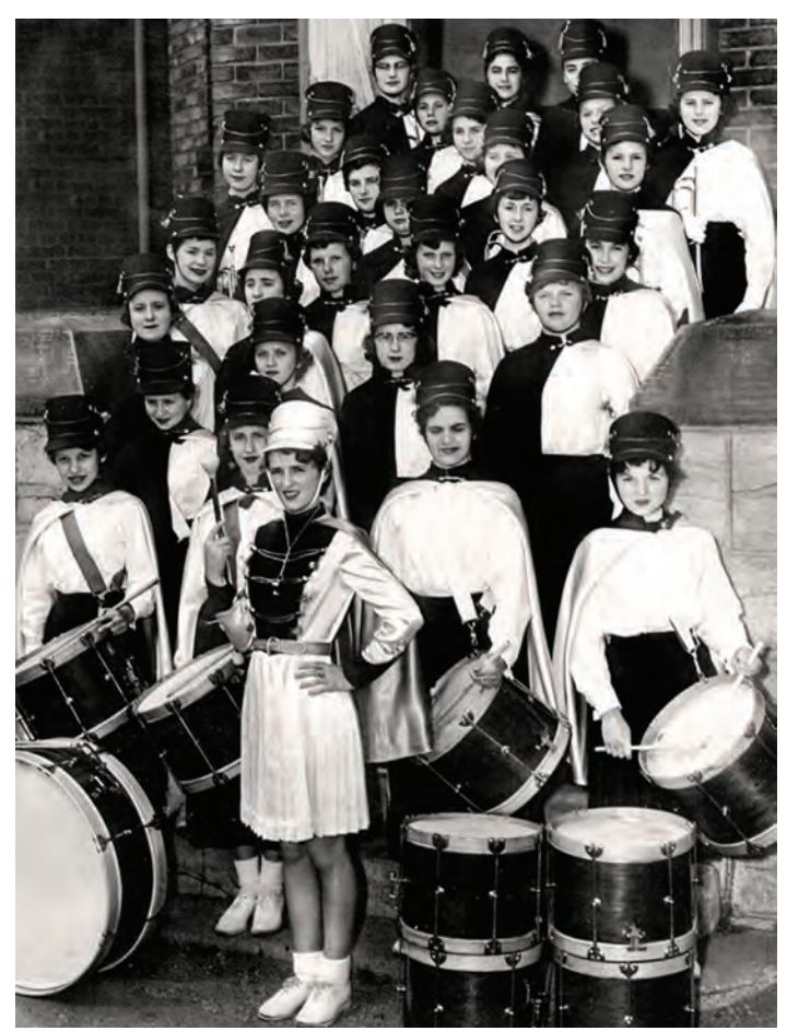
B.C.H. Girls' Trumpet Band (1955)

Originally there were sixteen members, and their first uniforms were ankle-length grey skirts and white blouses. In the fall of 1954 new uniforms were issued in green and white – these were the Corps colours until 1976. Membership increased each year and in 1956 majorettes became part of the Corps. In 1958 a ten-member colour party was added, and by 1959 the Corps had fifty-three members.