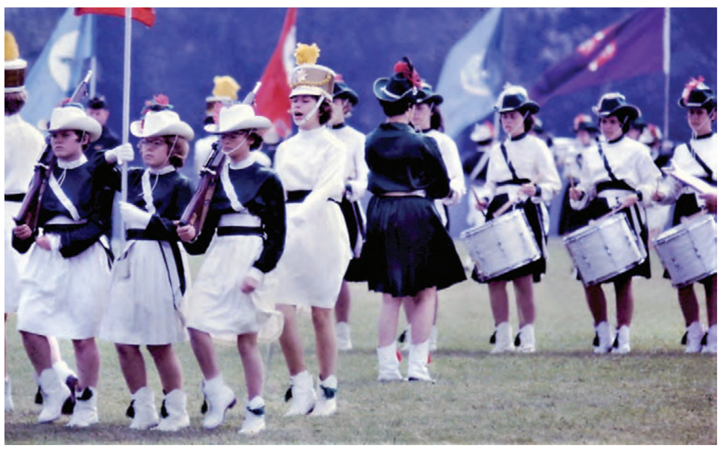
St. John's Drum Corps (Nationals, Waterloo, 1962)