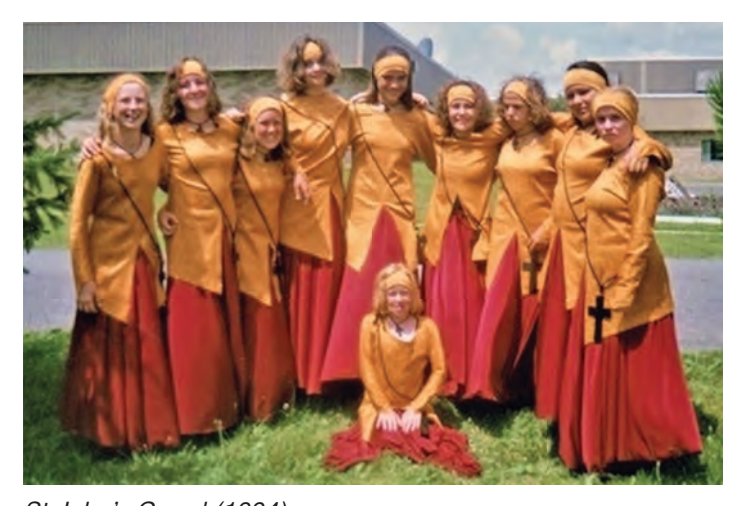
St John's Guard (1994)