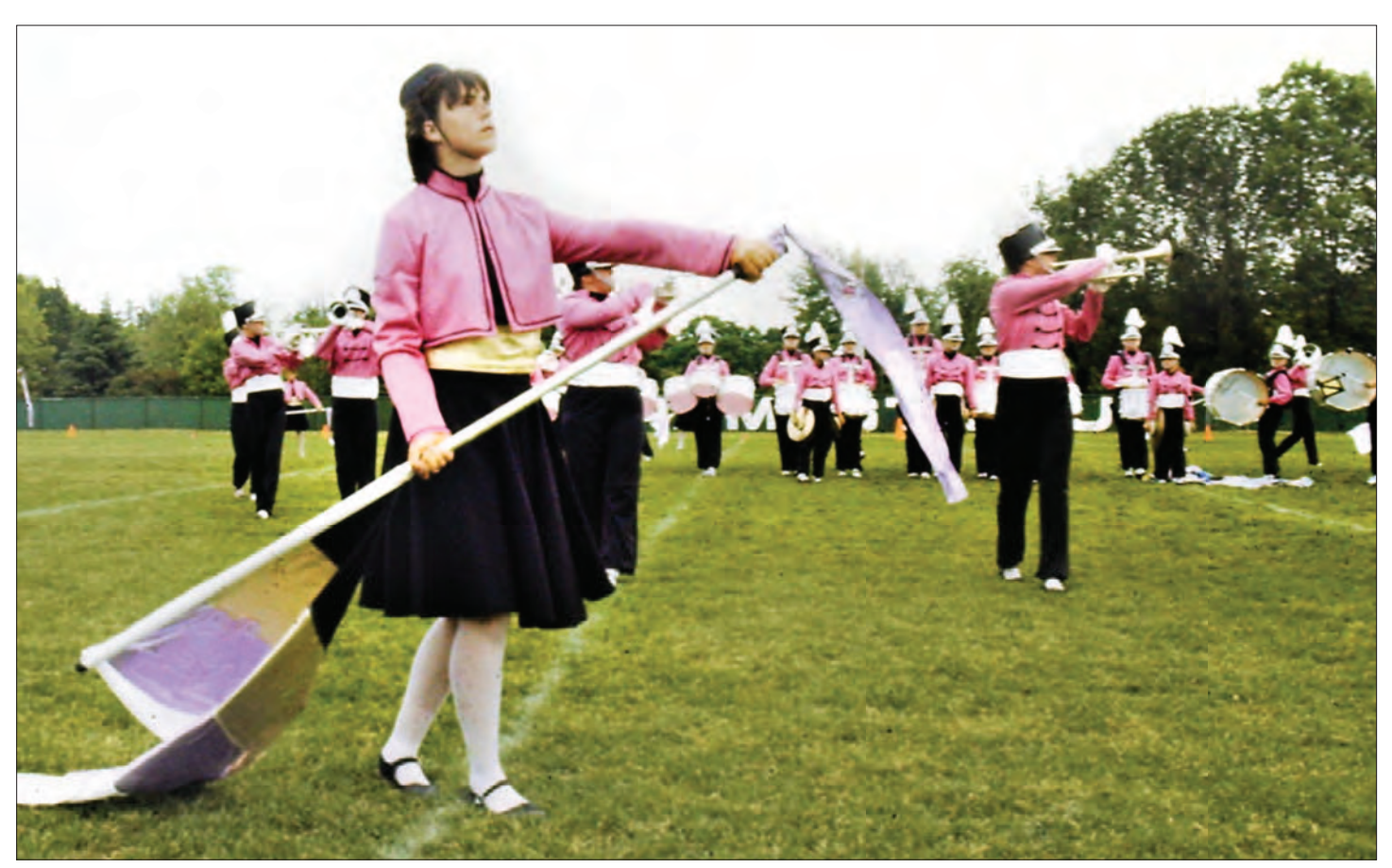
Brantford Girls (Waterloo, 1983)