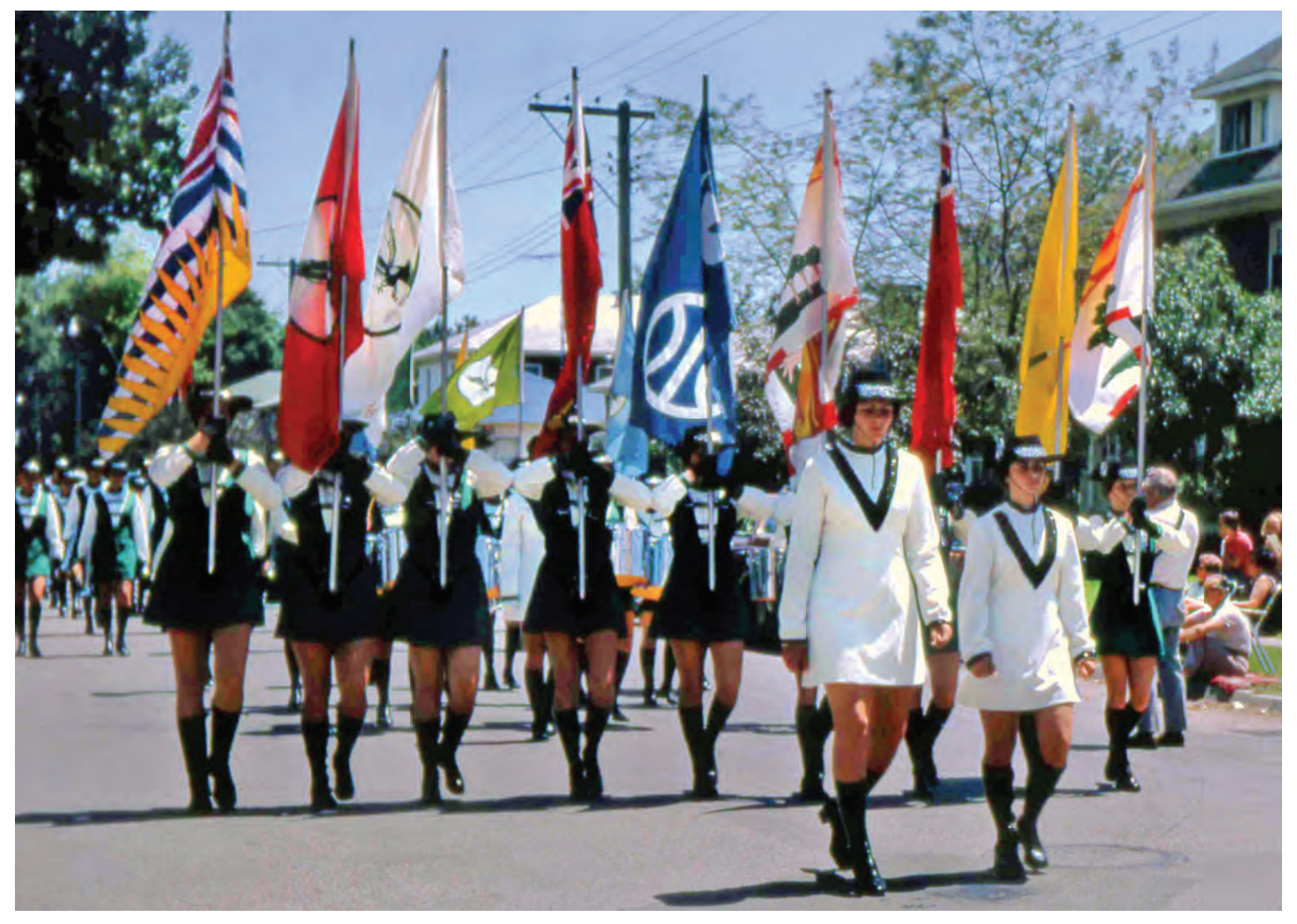
St John's (July 1, 1974)