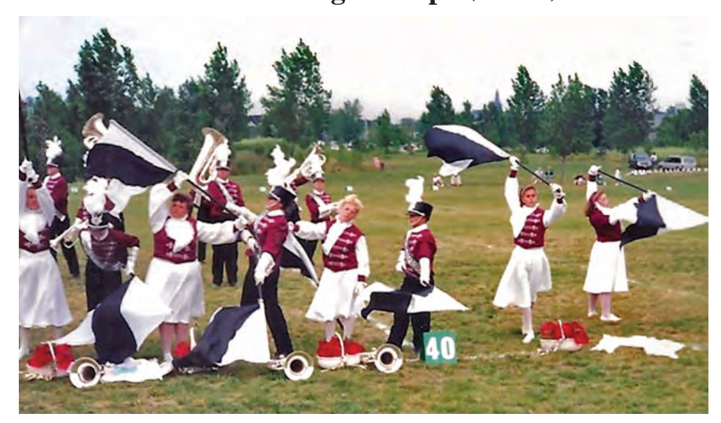
St John's in New Uniforms(1990)