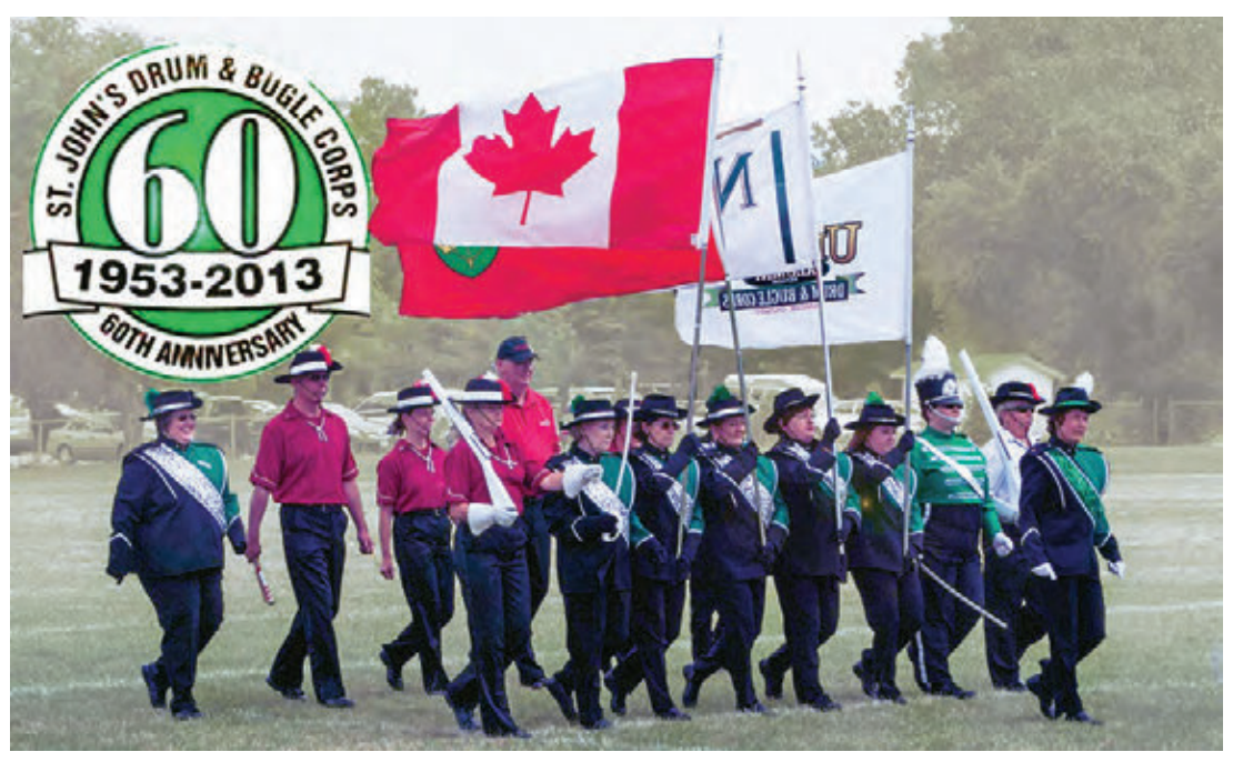
Former members of St John's who march in various alumni corps (St John's Reunion, 2013)

organization alive. Using social media and holding fundraising events to keep their alumni members connected and involved, the Committee's focus is to continue to support local youths in their pursuit of the Drum Corps experience that each of us once shared and will forever treasure.