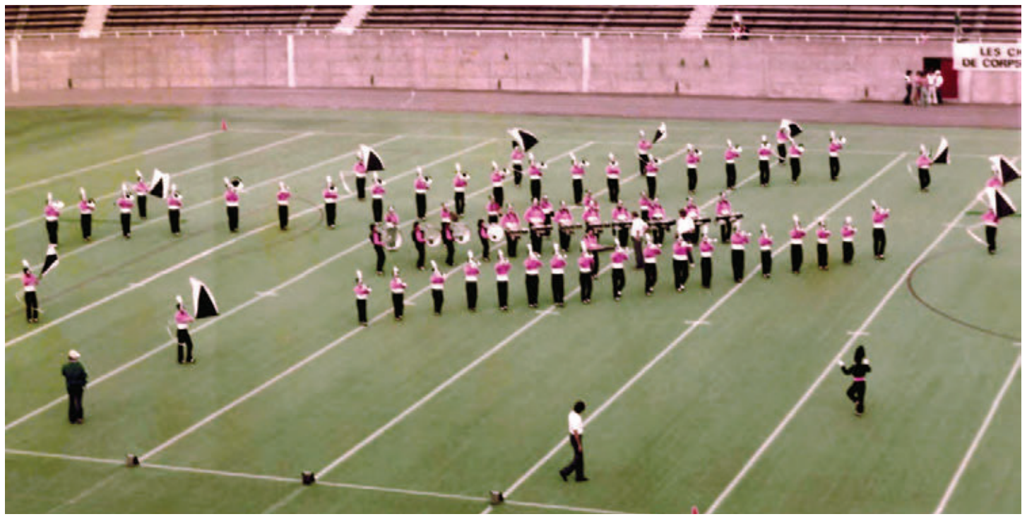
Brantford Girls (DCI, Montreal, 1982)