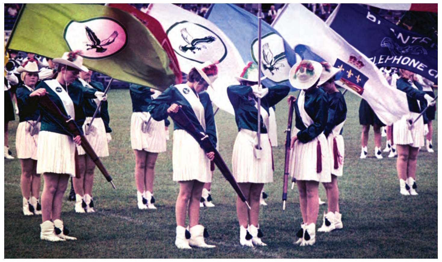
St John's (Nationals, Kingston, 1968)