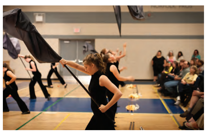
St John's Winter Guard (2012)