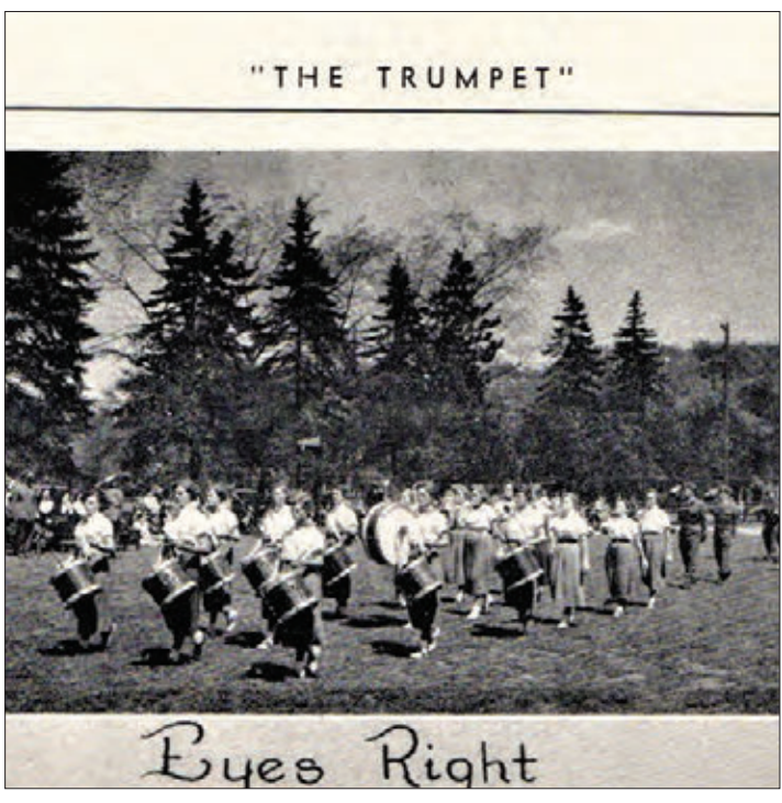
First public appearance (1954) The corps paraded in ankle length skirts and white blouses.