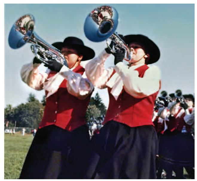
St. John's in their new red and black uniforms (1977)