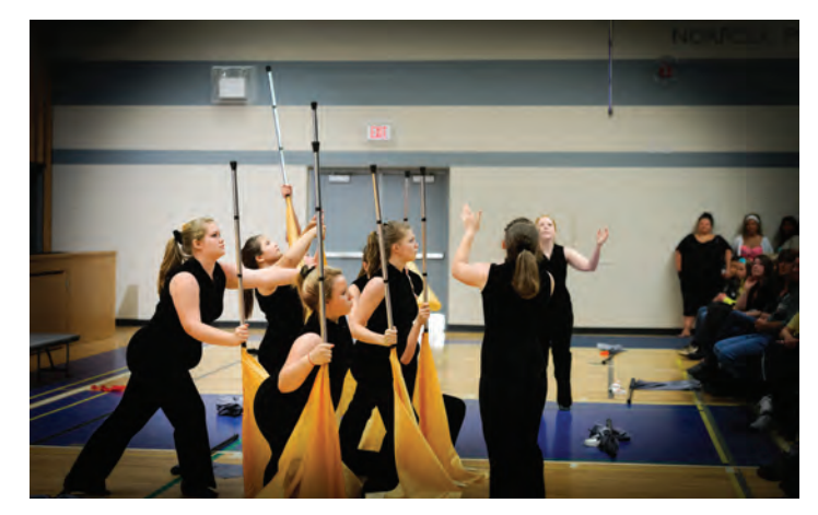
St John's Winter Guard (2012)