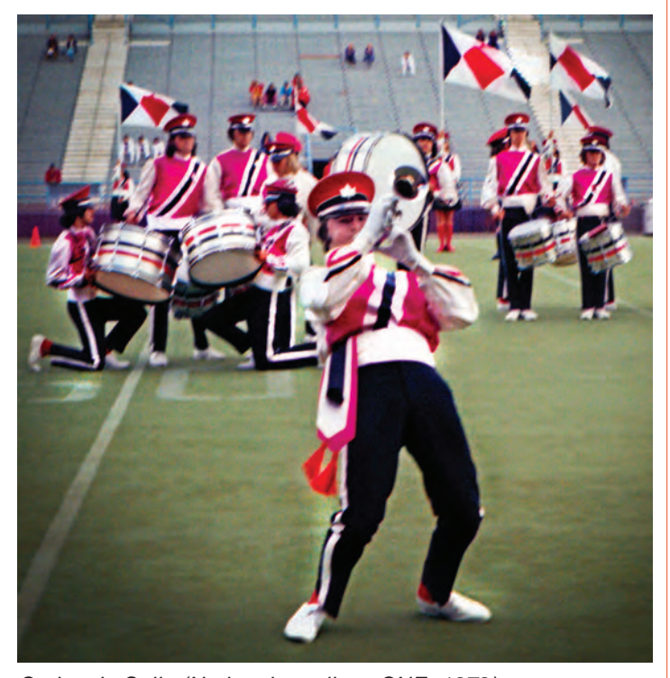
Cadets LaSalle (Nationals prelims, CNE, 1972)

Rider of the Canadian Football League. Back at the corps hall after the game, uniforms were removed and instruments cased for the last time and the Cadets LaSalle was no more.