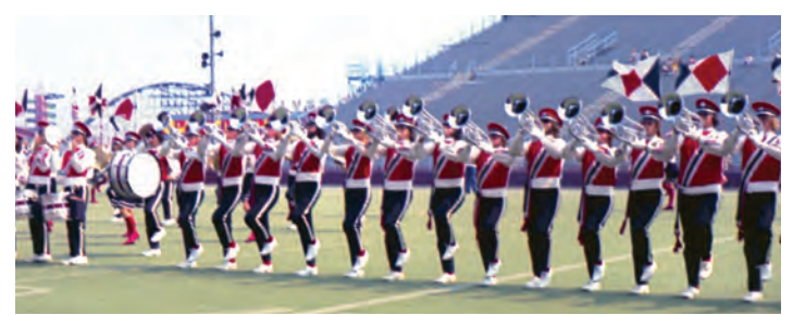
Cadets LaSalle (Nationals prelims, CNE, Toronto, 1973)