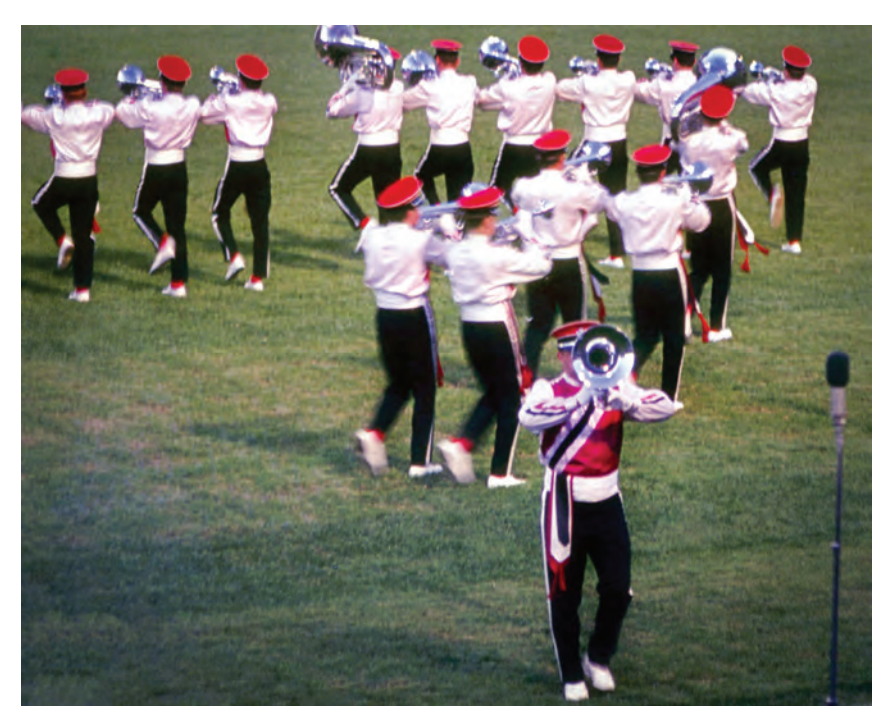
Cadets LaSalle (1968)

rising in North America and 1970 should see the results of this growth.