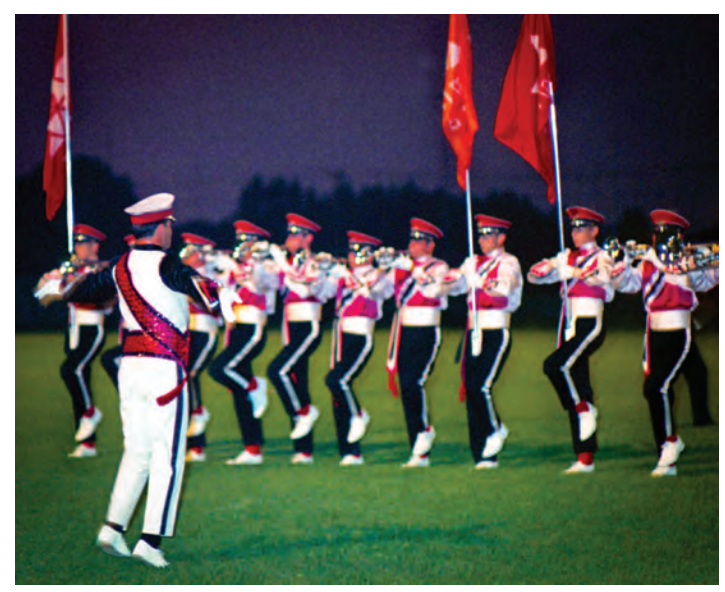
Cadets LaSalle (1967)

This article is used by permission – article originally appeared in "A History of Drum & Bugle Corps," volume 2 and is among profiles on 86 junior and senior North American organizations. Both volume 1 and volume 2 are available for immediate download in the store of www. drumcorpsworld.com. The electronic files are $1.99 each. Both books contain 432 pages.