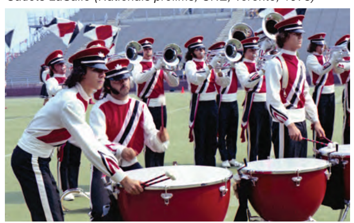
Cadets LaSalle (Nationals prelims, CNE, Toronto, 1973)