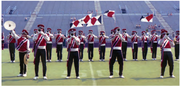
Cadets LaSalle (Nationals prelims, CNE, Toronto, 1973)