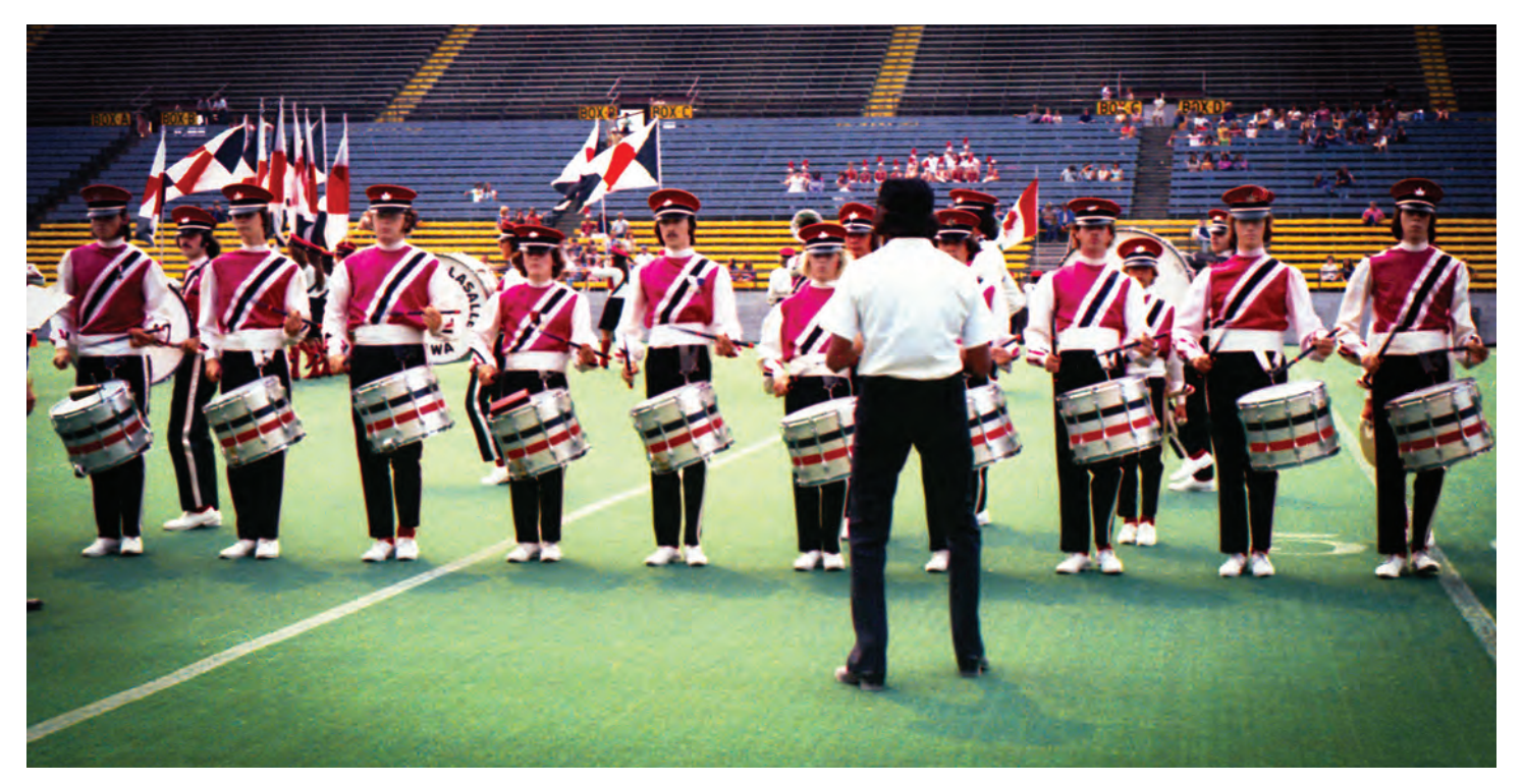
Cadets LaSalle (Big 10, Hamilton, 1972)

line was still tossing full weight British army issue Enfield rifles and continued as an all male section. The corps had a full summer of competitions including another stop in the Manning Bowl in Lynn Massachusetts for the World Open where it was rewarded with the High Execution Drums trophy. Unfortunately, a night of triumph soon degenerated into chaos as the bus driver on the drum line bus (Gordie) became disoriented by the "we're number one" chants from the back of the bus and took well over an hour to get back to the