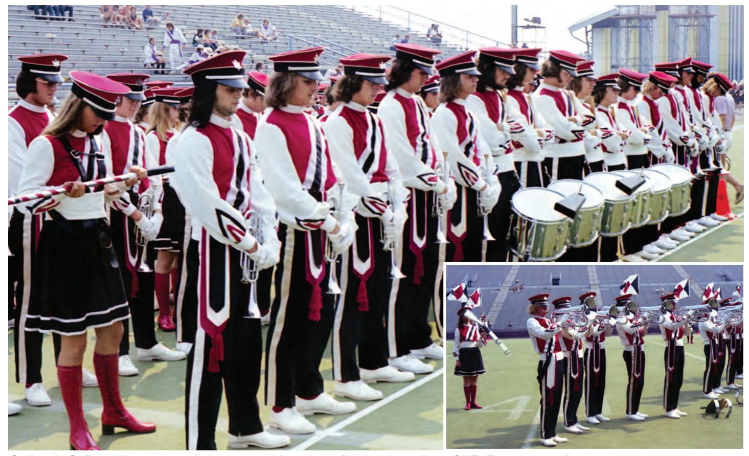
Cadets LaSalle waiting to start their show and in concert (Nationals prelims, CNE, Toronto, 1973)