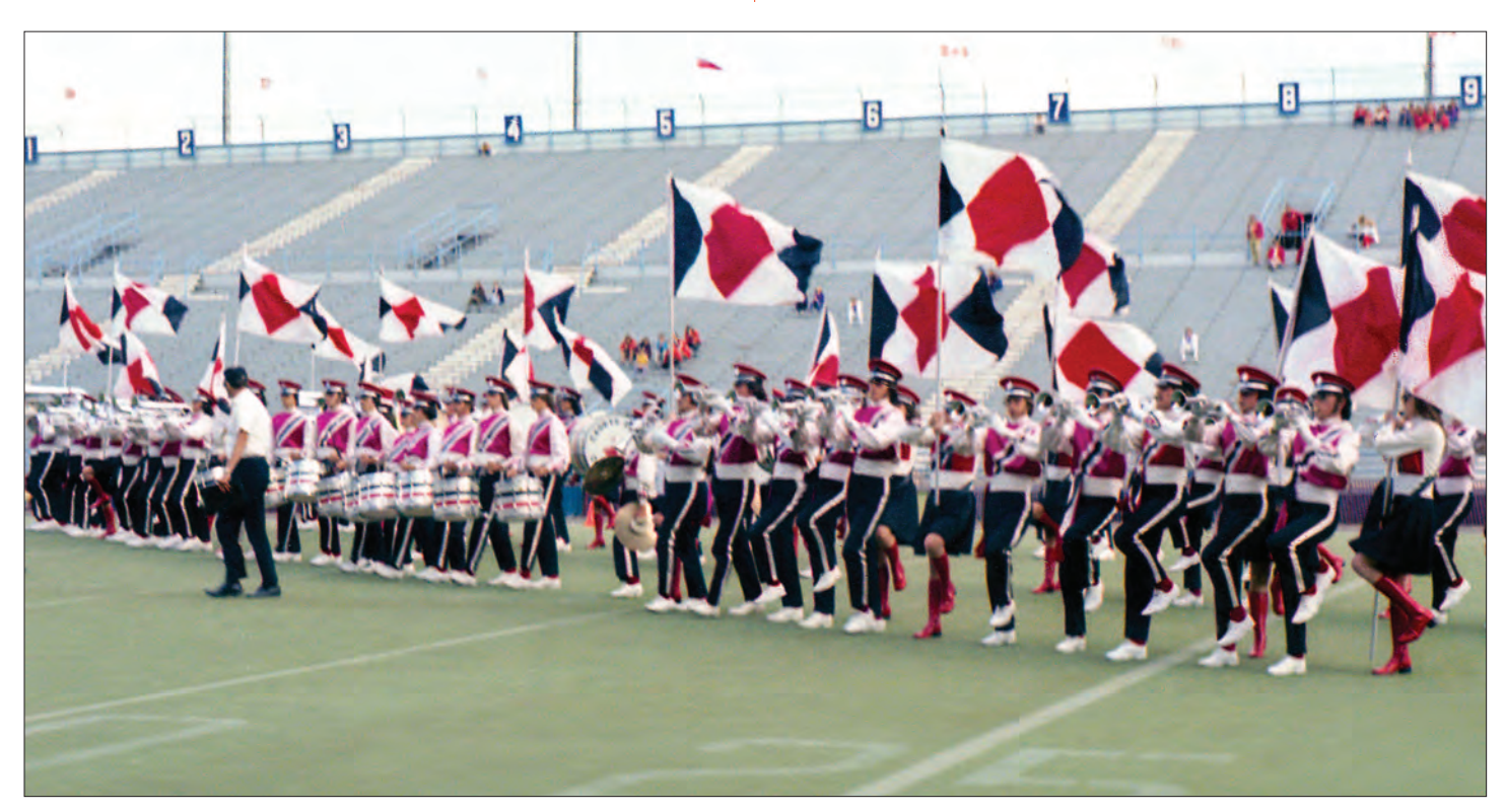
Cadets LaSalle (Nationals prelims, CNE, 1972)