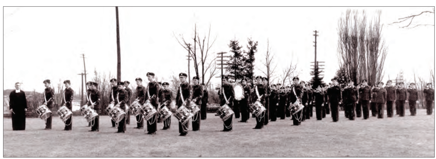
LaSalle Academy School Band (1955)