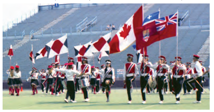
Cadets LaSalle (Nationals prelims, CNE, Toronto, 1973)