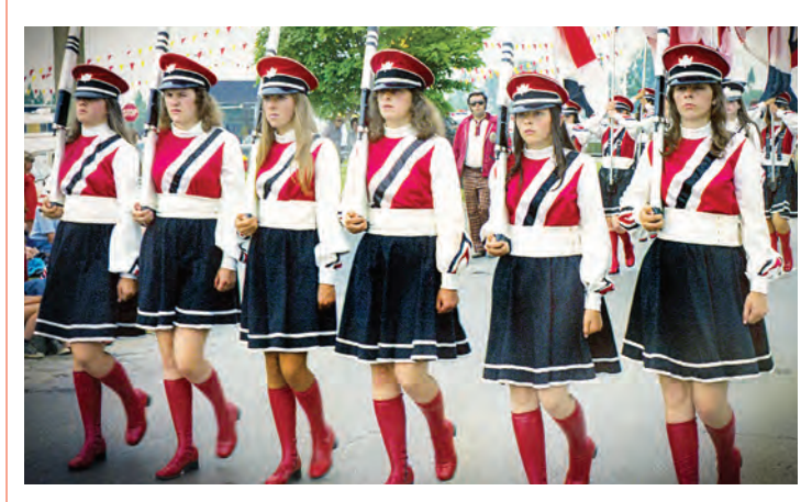
Cadets LaSalle with female rifles (Ajax, 1973)

As the opening notes of "One Fine Morning" came echoing back onto the field from that beautiful roof overhang of the old stadium the corps knew it would be a special night. Not only would the Cadets tie De La Salle for the title of National Champions in their own back yard but also it was arguably the most emotional performance of the corps ten-year history. One week later the corps performed for the last time at a half time show for the Ottawa Rough