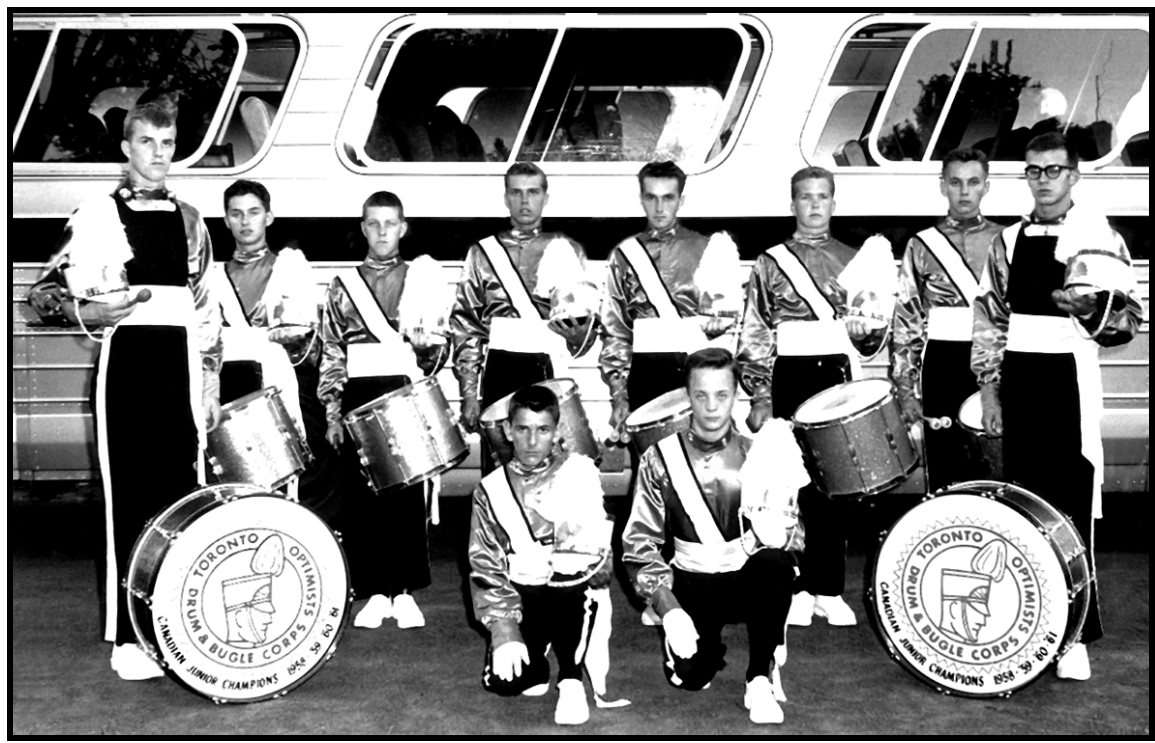
The Drumline (Left to Right)

The first time the corps wore their new uniforms — and just before beating Blessed Sacrament. Here are a couple of photos taken just before the show